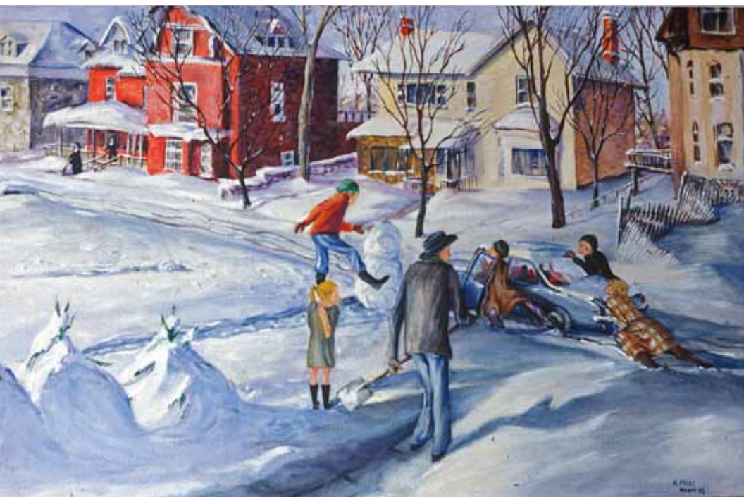
Painted from my house on Daly Avenue, Ottawa after a typical December snowstorm.