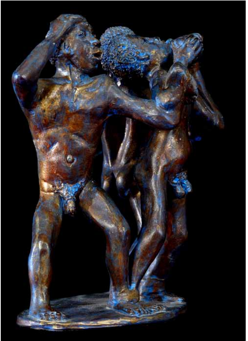
Men to be sacrificed.