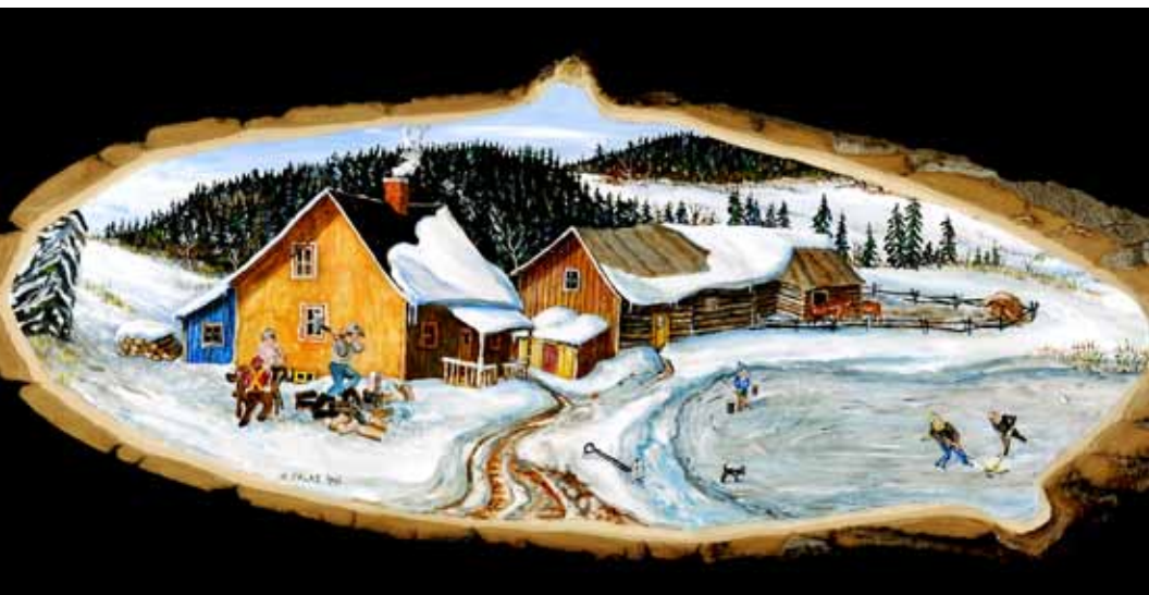
Painting on a cross section of a willow tree.