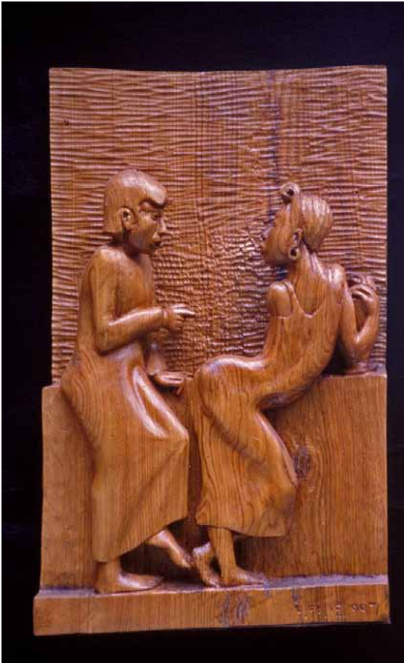
Jesus talking to the Samaritan woman at the well.