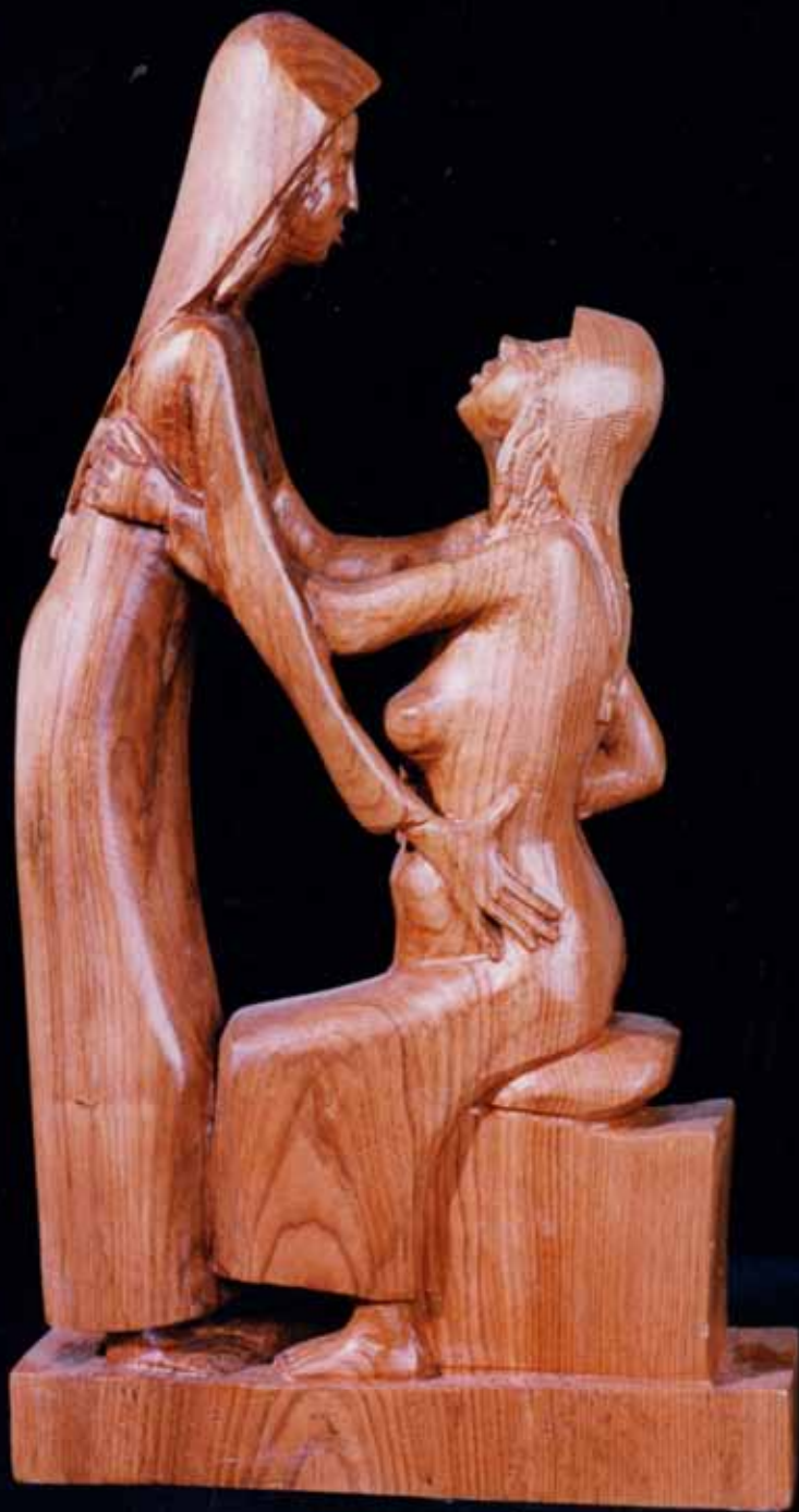
Mary with Elizabeth, pregnant with John the Baptist.