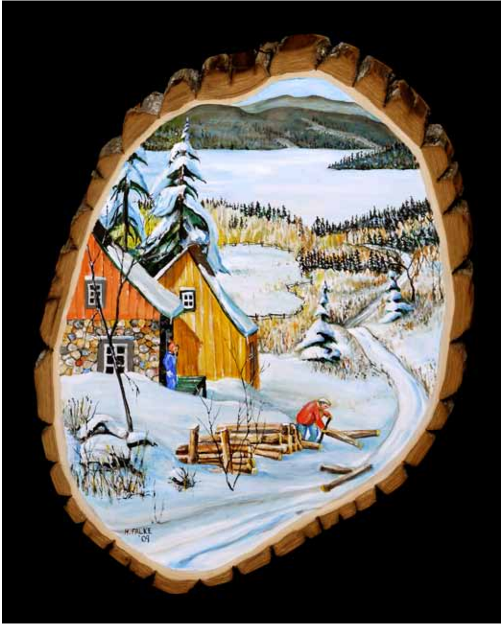
A work inspired by paintings of Claude Langevin