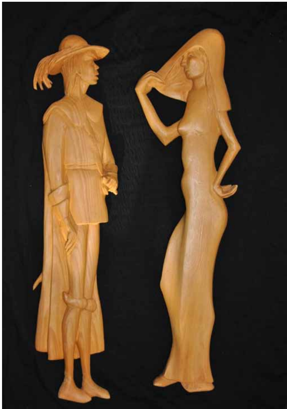
Shakespearean Heroines Series