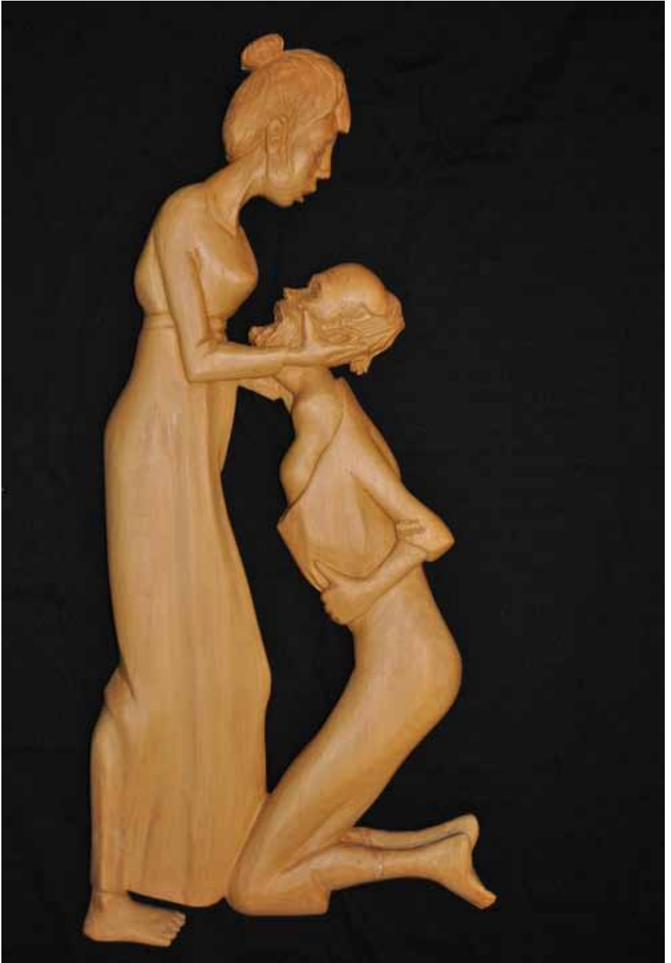
Shakespearean Heroines Series