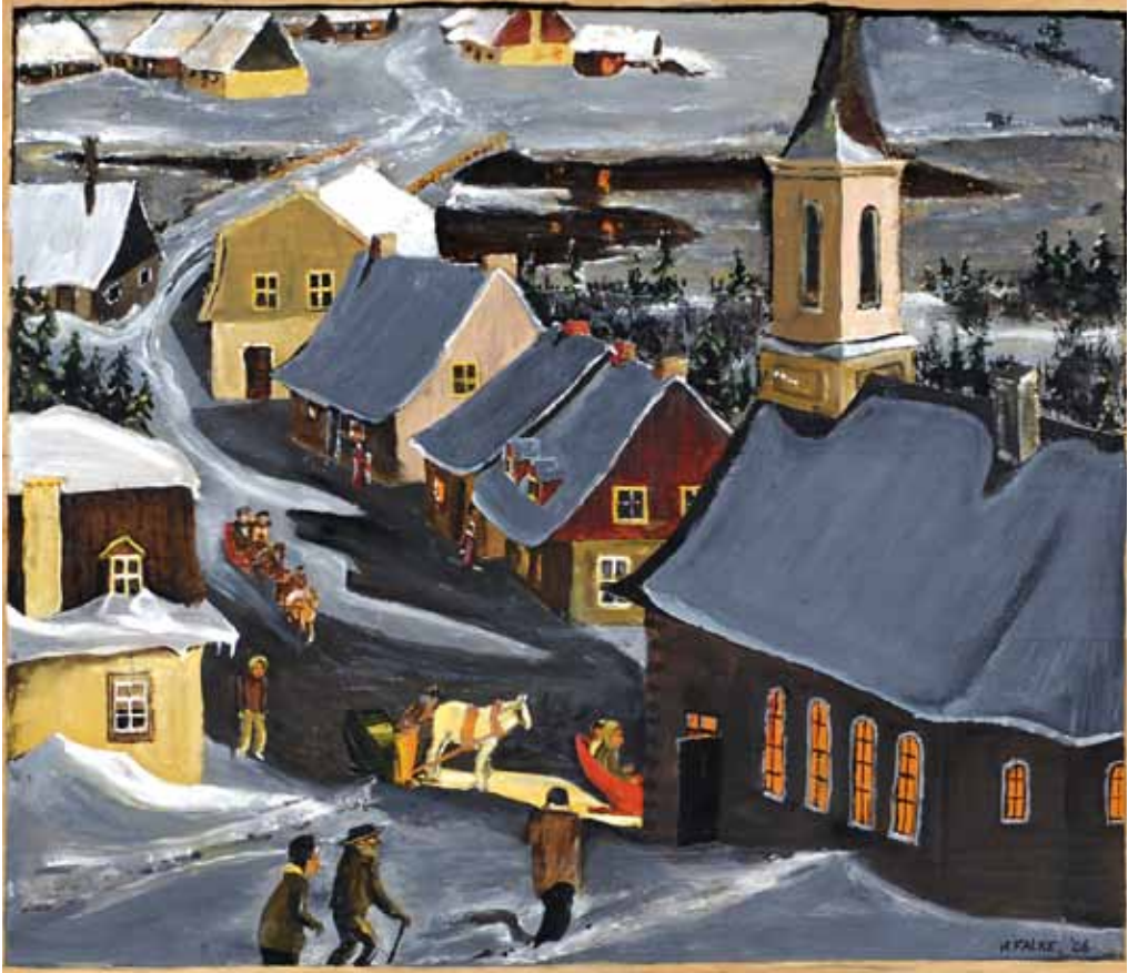
After Clarence Gagnon “Midnight Mass”