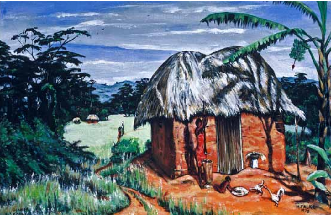
At the edge of Zingha forest, Uganda